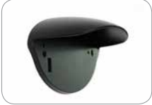
WC_HR50 Weather cover for the HR50 sensor